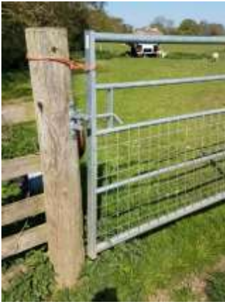
Making your way to a Metal Farm Gate.