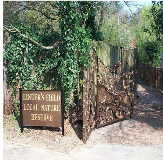
Entrance to Linder's Field

For further travel information contact Travel Line - 0870 6082608 www.traveline.org.uk