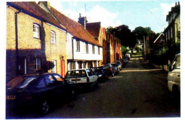
Ermine Street, Thundridge