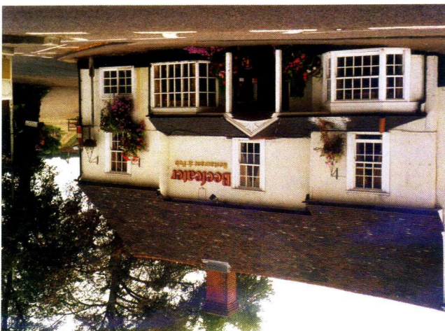
'ANCHOR INN' YOUR START AND FINISH