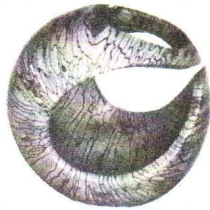
Sculpture at Downfield Gallery