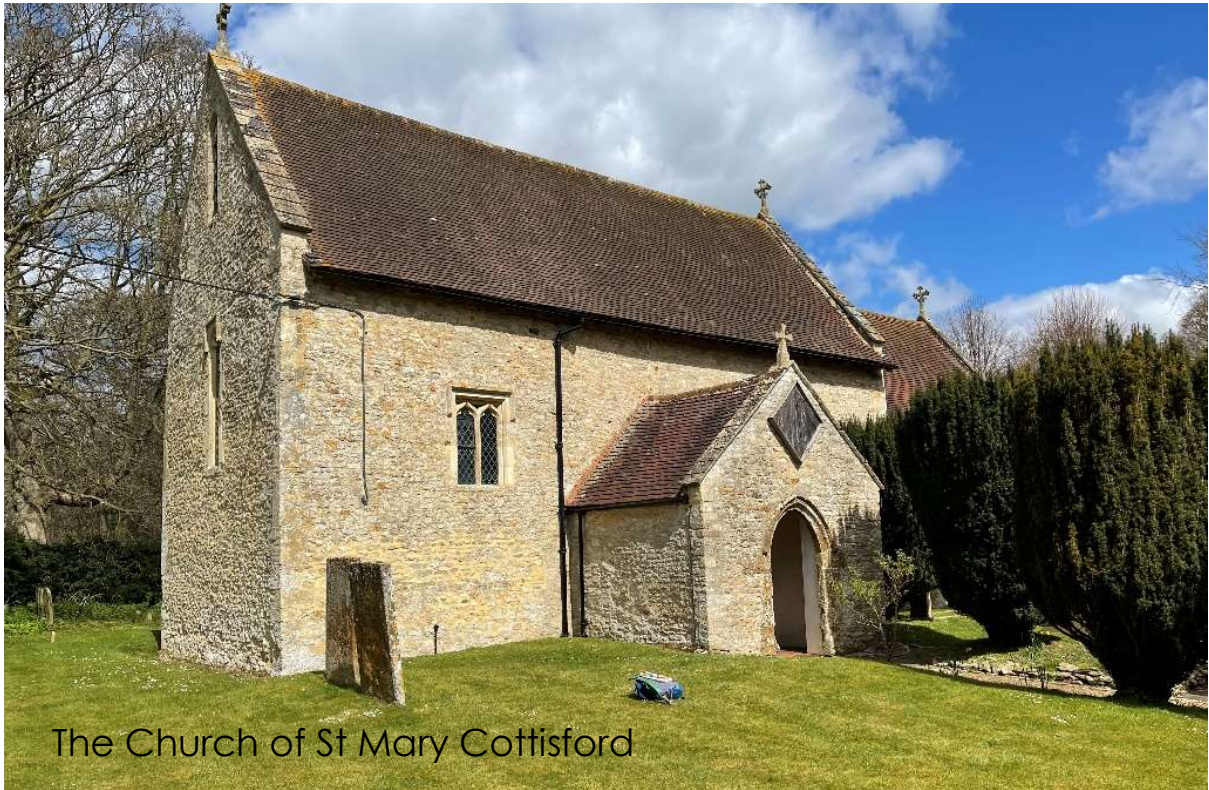
The Church of St Mary Cottisford