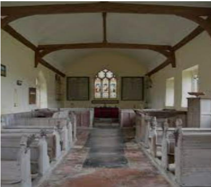
St Mary's Church, Badley

Leaving Needham Lake Information Centre head towards the footbridge and turn right onto the path (do not cross the footbridge) with River Gipping on your left. Path keeps close to the river (ignore any paths going off to the right). Ignore bridge and path joining from the left, continue straight ahead keeping the River Gipping on your left. Fork left to take dirt path passing under road bridge. Continue along path, River Gipping on your left, over footbridge and passing Hawks Mill Lock. Continue straight ahead over second footbridge.