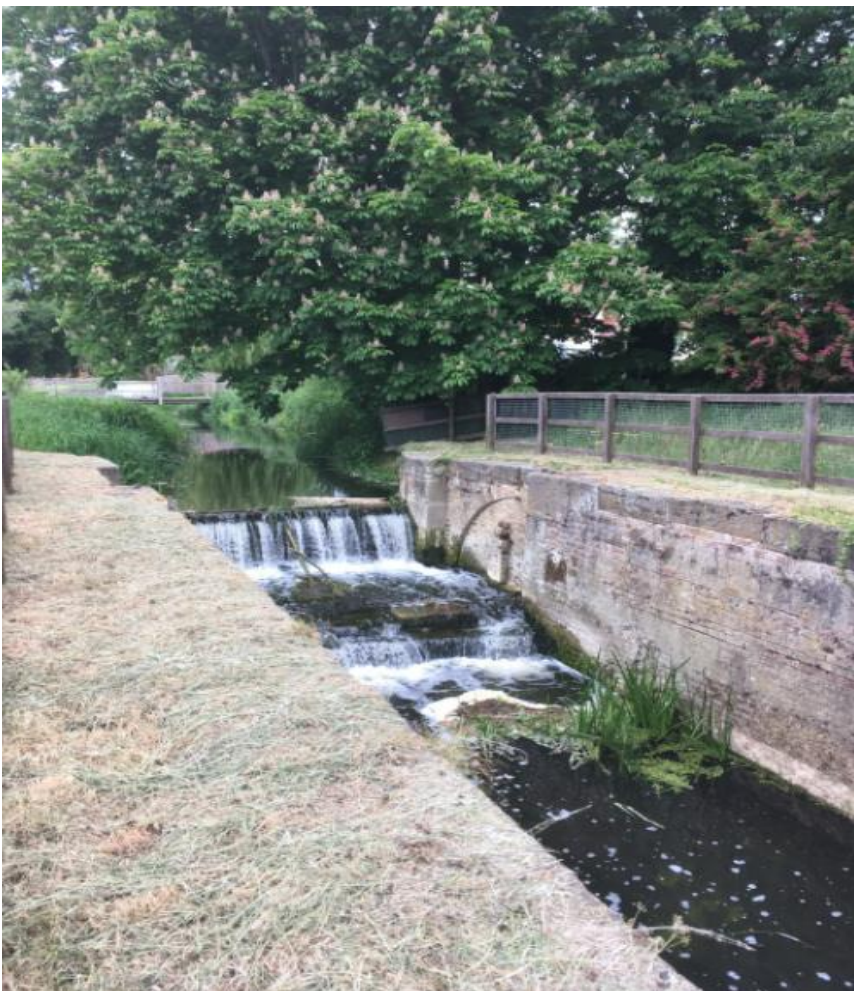
Creting Lock, part of the Stowmarket Navigation

Pass through another gate. Continue along path at side of the river eventually passing through another gate and passing Anderson Fishing Lake on your left. Through two more gates leading on to main road B1078. Cross road very carefully and turn right on the footpath over the bridge. At the end of the bridge turn left through the gap with River Gipping and Bosmere Lock on your left. Continue along path through play area to Needham Lake and Information Centre.