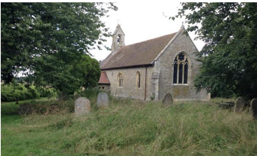
St Andrew's Church, Darmsden

Head up Grinstead Hill and after 30 meters cross the road, turning left at the footpath sign up Mill Lane. Continue along footpath climbing steadily with trees and bushes both sides. After a time the path levels out. Continue along path, which becomes a wide track and continue straight ahead with fields on both sides. Track now splits, take the track on the right, bearing round to the right, hedges on the right, then bearing left. Continue along track. Turn left to join wide track dropping down passing under pylons. Pass St Andrews Church, Darmsden, on your right.