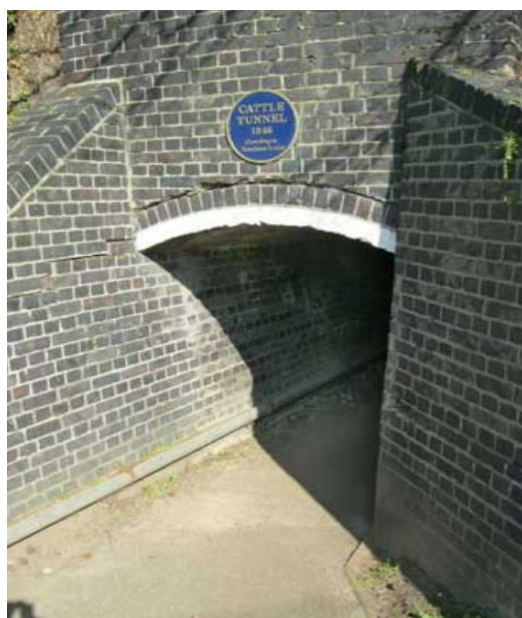
Needham Market Cattle Tunnel

Turn left in Station Yard, keeping to the left to return to the Cattle Tunnel. Pass through the tunnel and turn right. Bear left along the grass track and left again along the path circling Needham Lake and Nature Reserve. Continue along the path till you see the footbridge. Turn left over the footbridge back to the Information Centre.