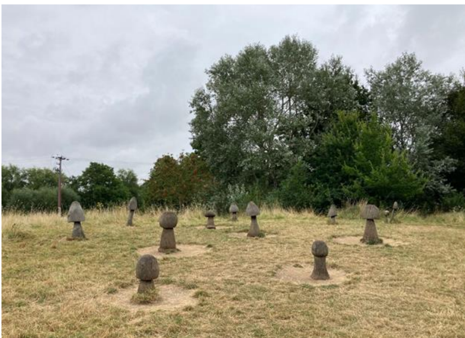
Mushroom sculptures at Needham Lake Nature Reserve

Continue along path over footbridge passing Hawks Mill Lock continue and ahead crossing another footbridge. Continue along the path keeping the river on your left until you meet a bridge crossing the River Gipping. Turn left over the bridge, continue straight ahead passing Ravens Farm on your left. Continue along the wide track. Turn Left through gate, continue along wide track trees on your right. Pass through another gate and then Hawkes Mill Barn on your left until you meet the road. Turn right and continue along the road passing under the railway bridge. Before the main road turn left at the Ancient House dated 1480. Turn left again at the Ark, follow the road bearing right into King William Street dropping down. Turn left under the railway bridge and follow the road round with houses on both sides and the railway on your right. Continue into the camping land, bearing right and passing the Cattle Tunnel and railway station on your right. Bear left along the grass track and left again along the path circling Needham Lake and Nature Reserve. Continue along the path till you see the footbridge. Turn left over the footbridge back to the Information Centre.